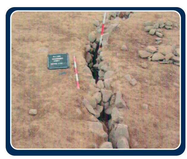
Stone-lined slot-trench of Enclosure 3

perhaps expressing distinctions of age, sex or social relations.