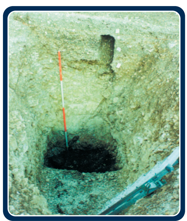
The pit under excavation.

The main interest of our research was the potential existence of the possible interrupted ditch/pit circuit. Privately-funded excavations were limited to small keyhole trenches, so initial exploration was undertaken by simple auger transects to find the potential features. In most holes, chalk was reached under a shallow ploughsoil, but very soon two augerholes of much greater depth clearly indicated one of the segments and it was not necessary to bottom the feature.