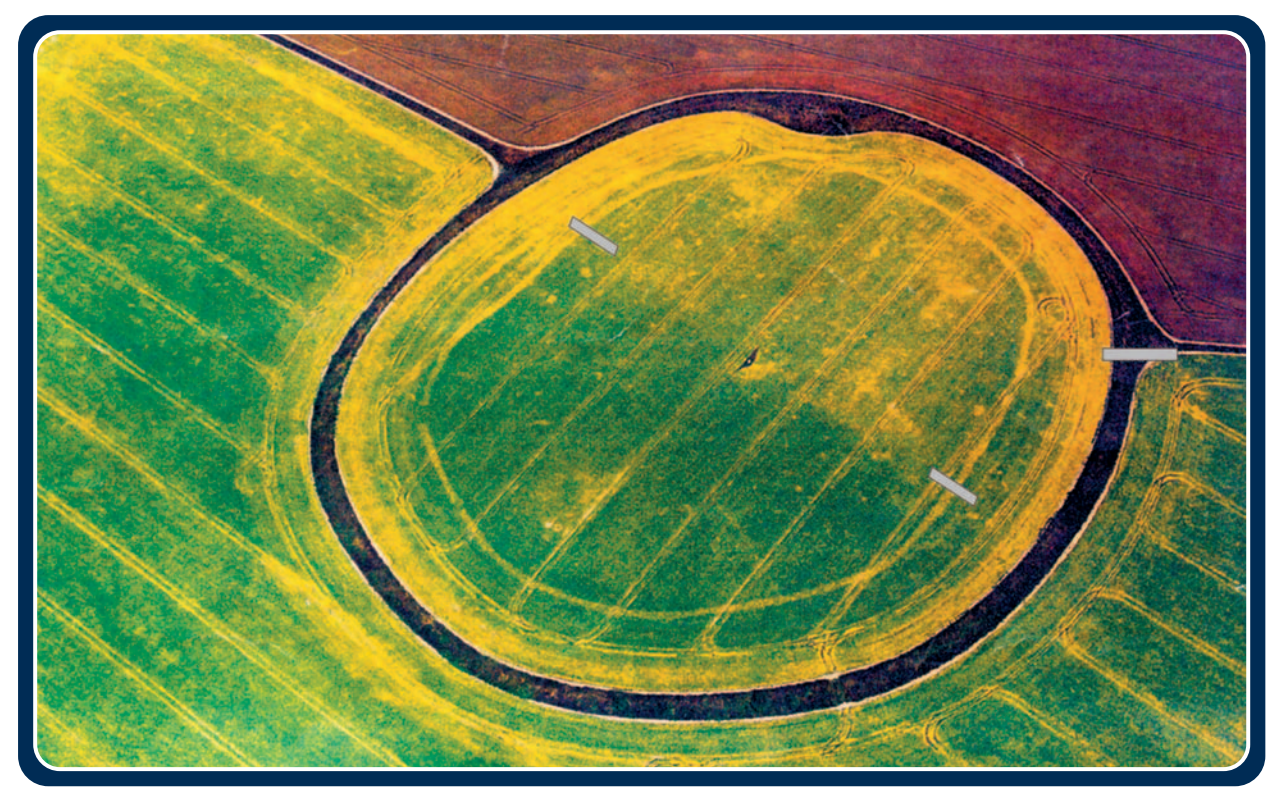
Oblique aerial photograph of Codford Circle (2001) from the south-east. The approximate position of the main excavation trenches (slightly exaggerated for clarity) are shown in grey.

circle, the area of which contains above nine acres, and the circuit amounts to three furlongs and one hundred and ten yards. It is surrounded by a neatly formed vallum and fosse, which, together with the area, have been much defaced by the plough." He goes on to say that "the smallness of the enclosure, as well as the slightness of the ramparts, evidently contradict the idea of its either having been made or used for military purposes; it has no signs of any entrance, nor is the ditch within, as we frequently find to be the case in the earthen works appropriated to religious purposes."