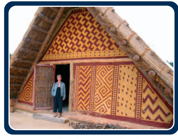
Reconstruction of one of the long houses from the settlement adjacent to the enclosure at Schletz. The decorative motifs and colours are taken from contemporary painted ceramics.

In the main building at Heldenberg is the museum exhibition. Using state-of-the-art technology one finds aerial photographs of startling quality, geophysical surveys draped over digital terrain models and one even finds one's hologram in the base of one of the deep ditches of the enclosures. Sunrises and sunsets over reconstructed entrances convincingly demonstrate the orientations of these monuments on the sun, moon and the Pleiades. To a student of British henges and timber circles, there is much that is familiar. The visitor is also surrounded by well displayed artefacts from the excavations and, most moving of all, the skeletal remains of their users. This is where these sites become sinister: many