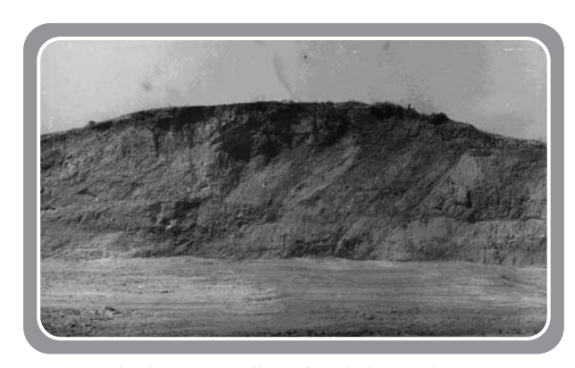
Mud-volcano near village of Mednikarovo, known as Atanasivanova mogila

A grave in a prominent landscape feature immediately provokes the question of the perception of the mud-volcano in the past. Was it considered as a natural (a low hill) or a cultural (ancestral mound) feature? On the basis of the burial mode, it is highly probable that the burial in Atanasivanova mogila can be dated to the Early Bronze Age. According to the results of the GIS analyses, the mud-volcano was located along one of the main regional routes. The volcano was there prior to any human occupation but its mound-like shape gained some specific cultural meaning. At the beginning of the Bronze Age, the Maritsa Iztok region included one mature tell, four "growing" tells and at least two barrows. In a landscape of mound-like cultural features and with an already established concept of a formal mortuary domain, a prominent hill silhouette that dominated the local landscape provided an excellent opportunity for incorporating the feature in the system of landscape communication. The act of burial within a feature that was strongly reminiscent of an ancestral tell place, while at the same time resembling a formalized funerary arena, could be seen as a deliberate act of relating the newly dead to the (potential) ancestors and in the same time emphasizing the status of the deceased.