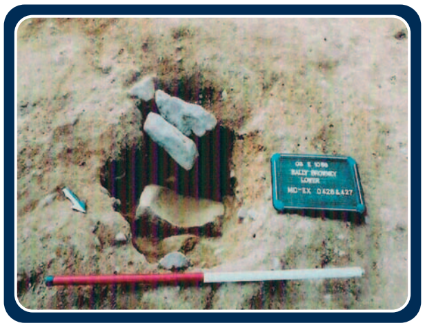
Saddle quern in entrance post-hole of Structure B

Although some of these finds, particularly the single sherds of pottery, may be dubious, others are certainly worth exploring further, particularly the saddle quern fragments recovered from substantial post-holes defining the entrances to both Structure B and the enclosed Structure E. These types of deposits are frequently found on settlement sites and generally interpreted as the convenient re-use of broken artefacts as packing stones. While this is a possibility, there are other, less functional factors that could also be considered. The possibility of deliberate fragmentation, for example, cannot be overlooked, particularly when one considers how substantial these types of stone artefacts are. Their symbolic associations with food production may have furthered their importance, while their inclusion in a significant part of the structure, the entranceway, may also have been expressive. Thresholds are frequently noted, both throughout prehistory and history and from ethnographic examples, as liminal areas, highlighted in some way or viewed as transitional places, and